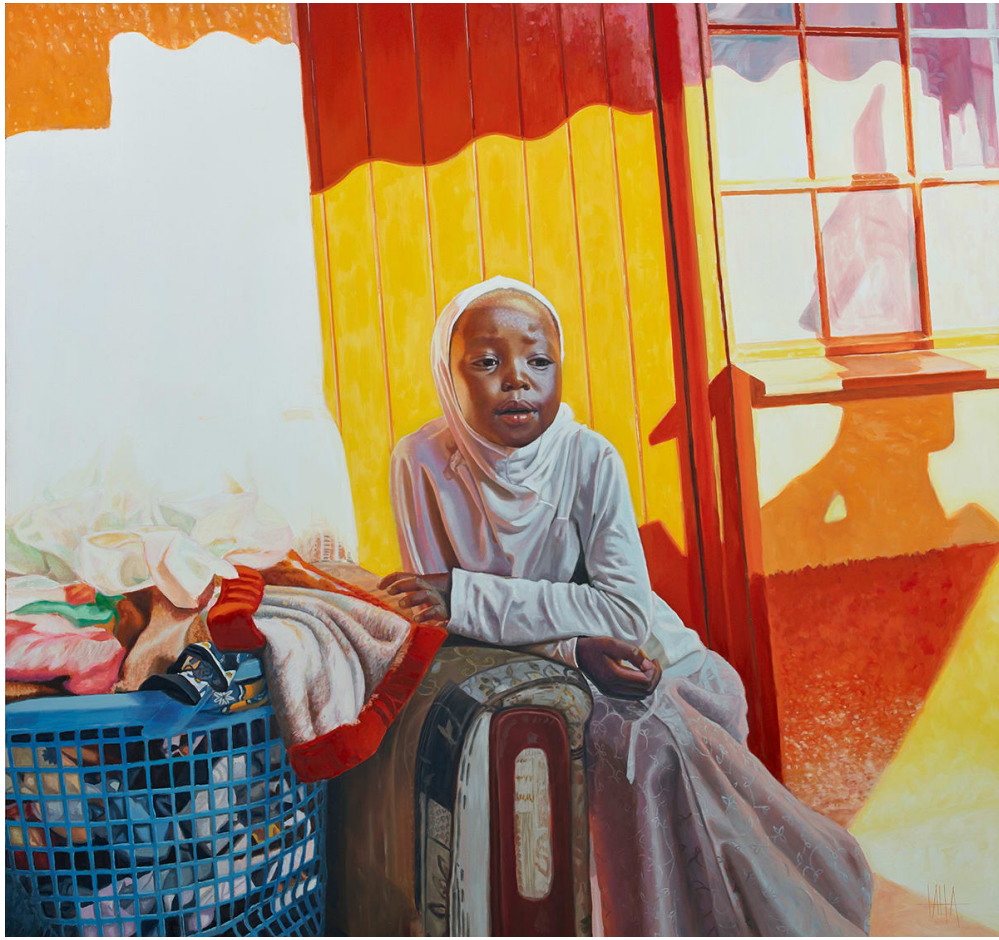
Taha Clayton Soular_Power_xhwsxu_1 Oil on Panel