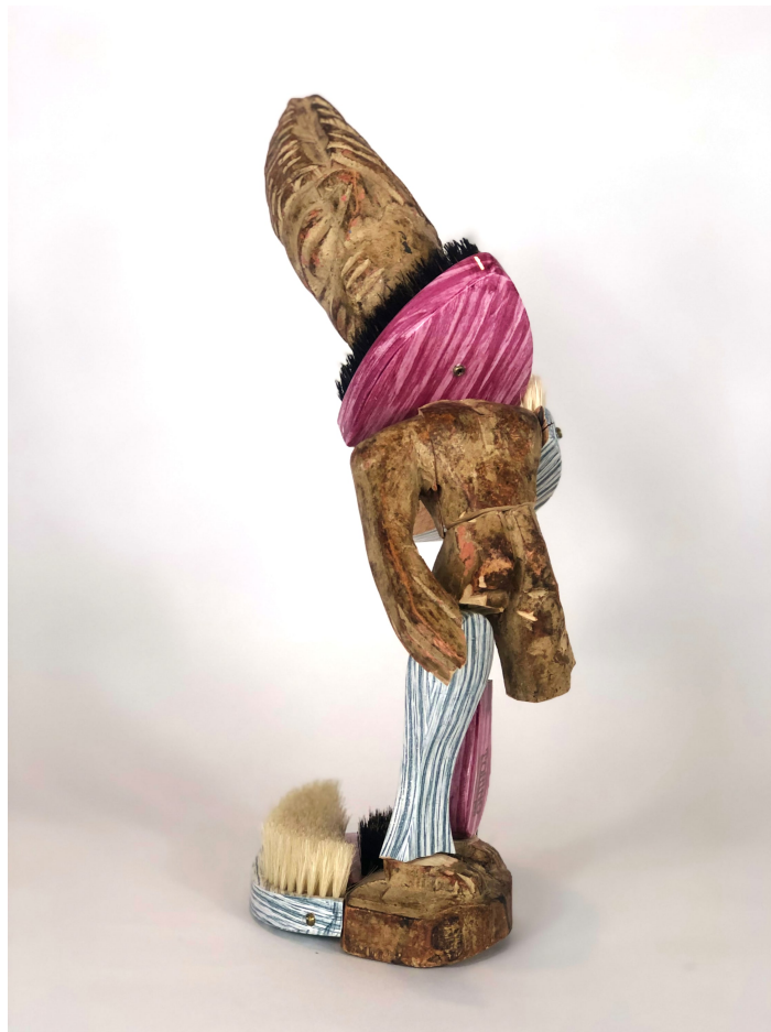
Anthony Akinbola Chopped and Screwed #01 (Pink/Blue) Ibeji, wave brush, screws 14.8 x 9.3 x 2.2 in