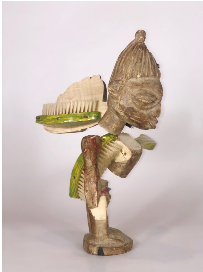
Anthony Akinbola Chopped and Screwed #02 (Green/Grey) Ibeji, wave brush, screws 13.2 x 6.5 x 2.2 in