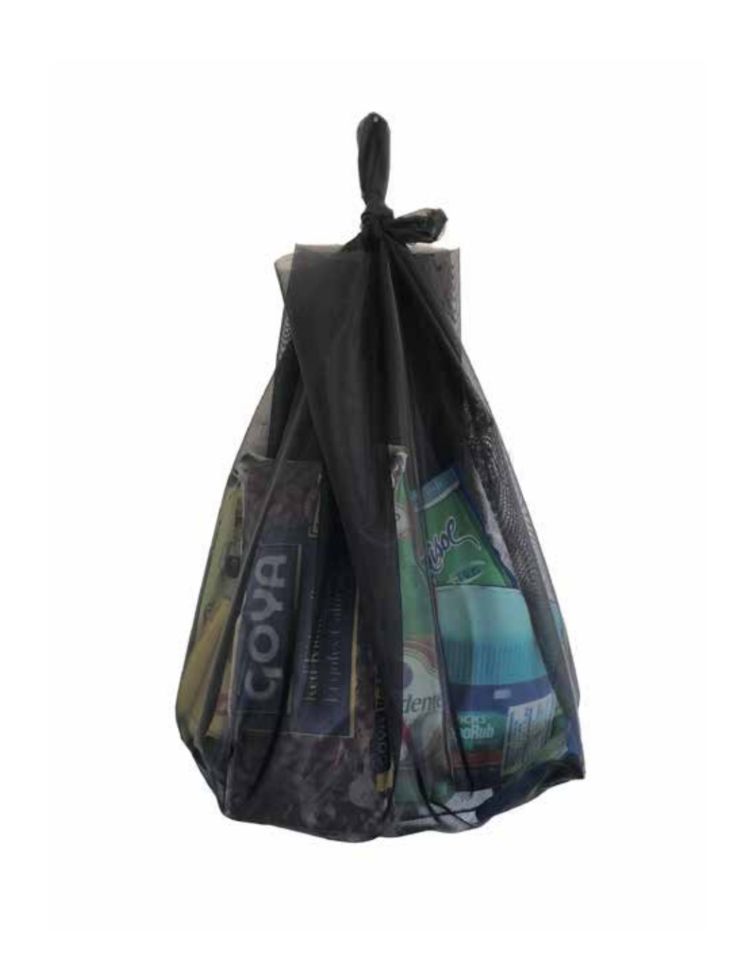
Black Bag Up a Six Floor Walk-Up

polyorganza, Digital print on Brushed Nylon, Felt & Foam 48 \times 32 \times 6 in