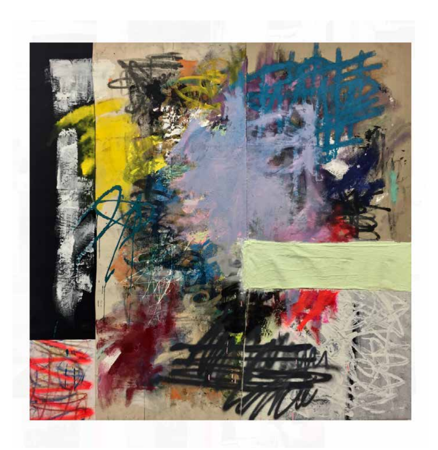
Yo Ask, Let Me Get a Chopped cheese, no lettuce

acrylic, enamel, graphite, ink oil pastel, plaster cast, oil stick and spray paint on linen, canvas and plastic 56 \times 56 in