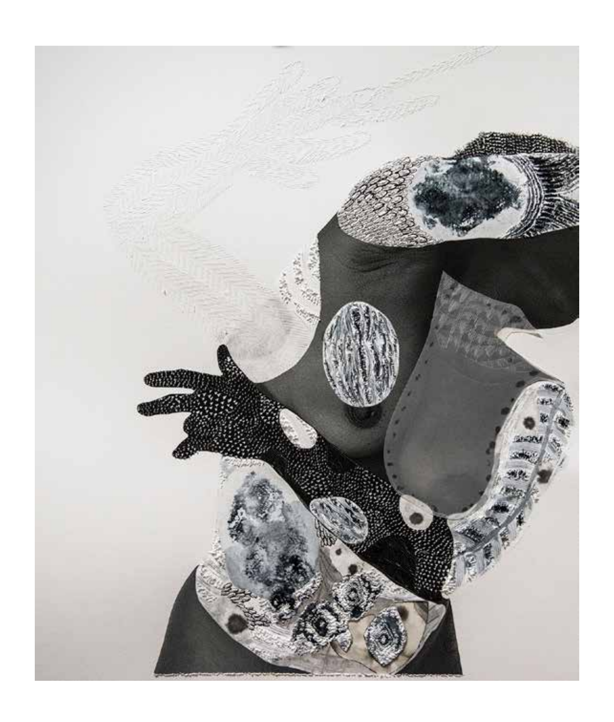
Reach hand sculpted paper photo print 24 \times 23 in