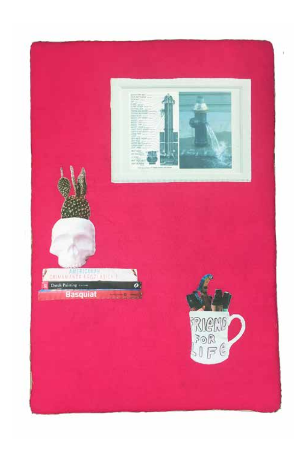
Portrait Of The Artist As A Young Herb digital print on fabric, Felt, stretched on foam