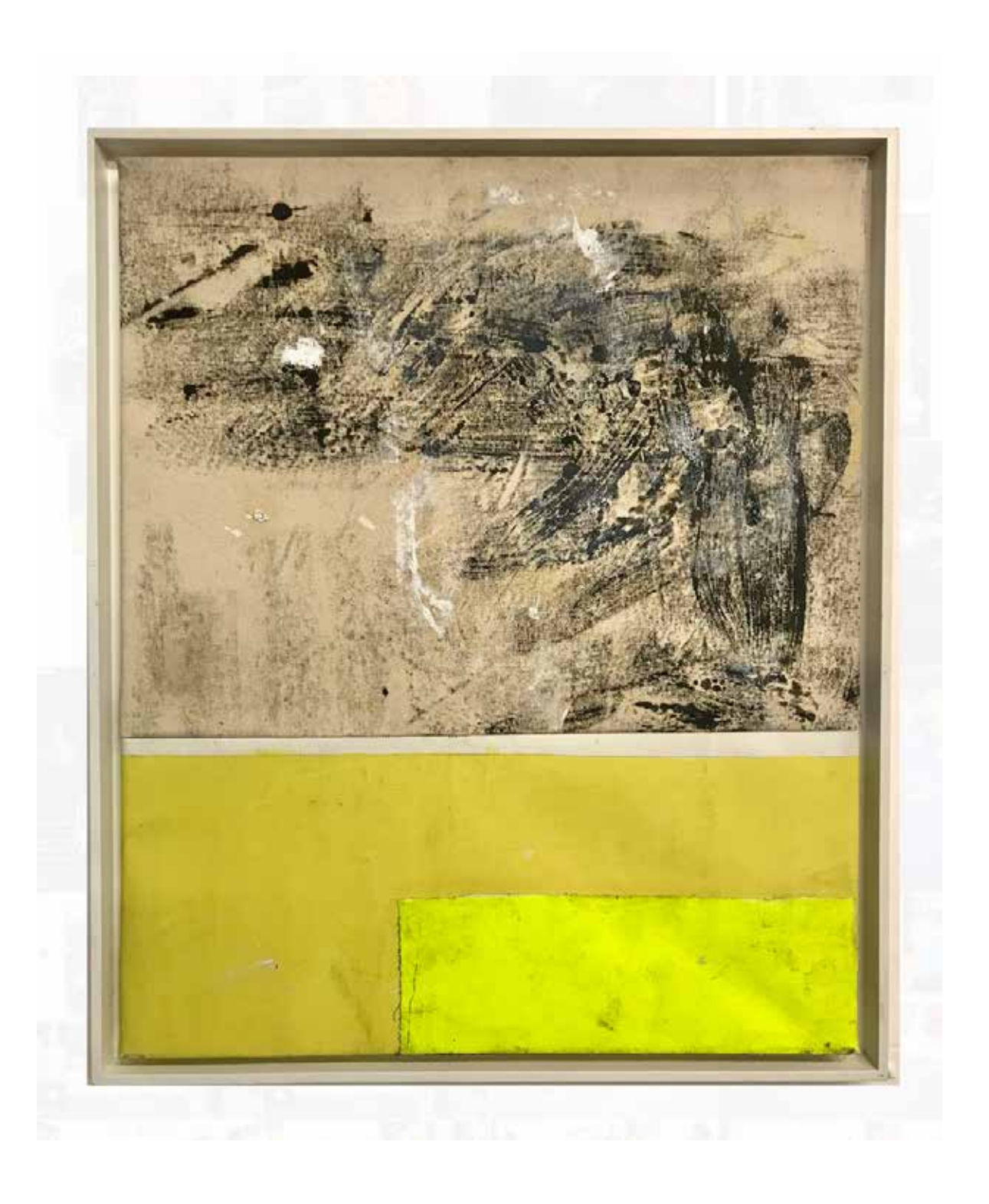
I Ain't Mad at Ya acrylic and oil on sewn canvas and linen 18 \times 20 in