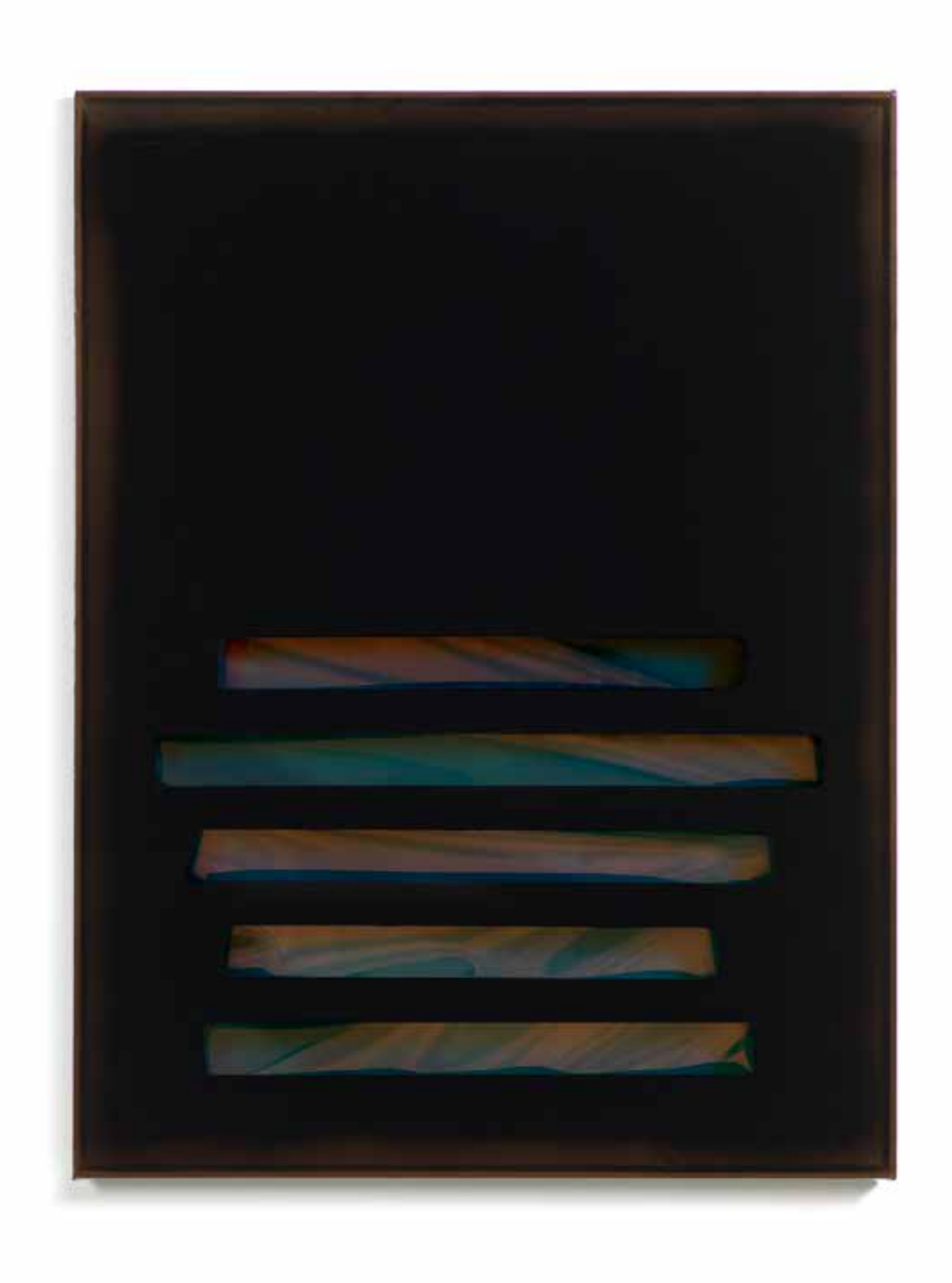
All We Got (Chance)

spray paint, iridescent film, vinyl 40 \times 30 in