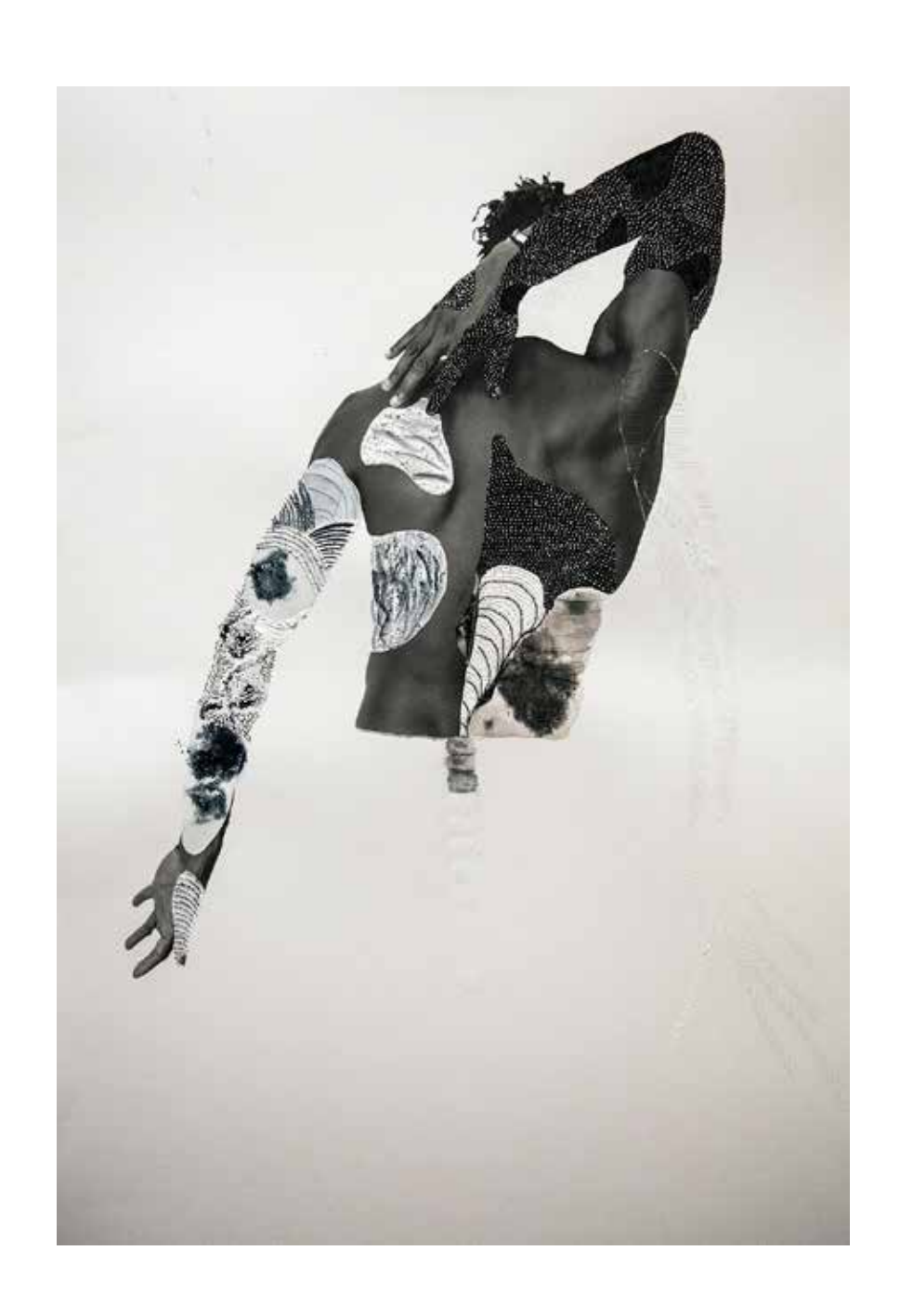
Flex II hand sculpted paper photo print 40 \times 26 in