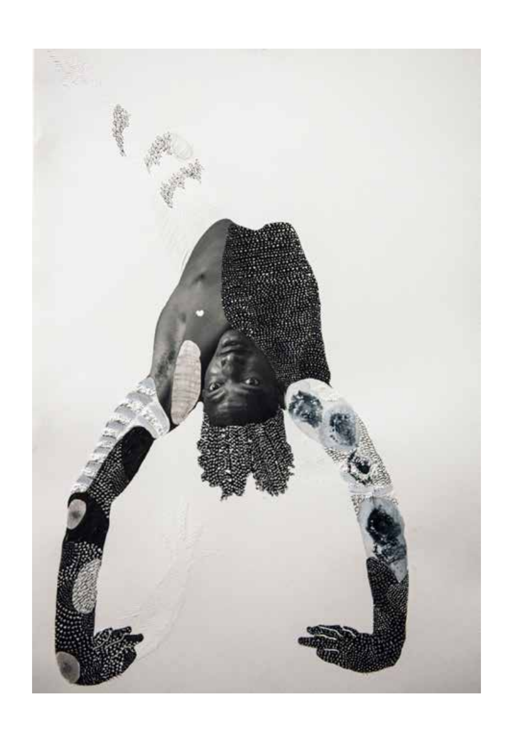
Shift hand sculpted paper photo print 22 \times 18 in