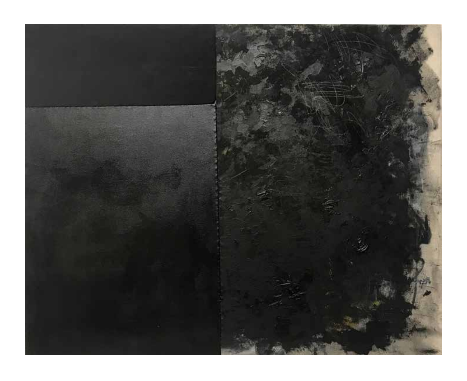
The Anomaly of Polysemic Negro

acrylic, enamel, graphite, oil and oil stick on sewn canvas 48 \times 60 in