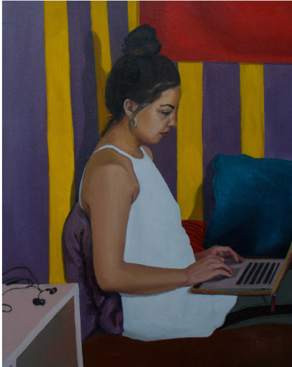
Sharraya Oil on canvas 30 x 24 in