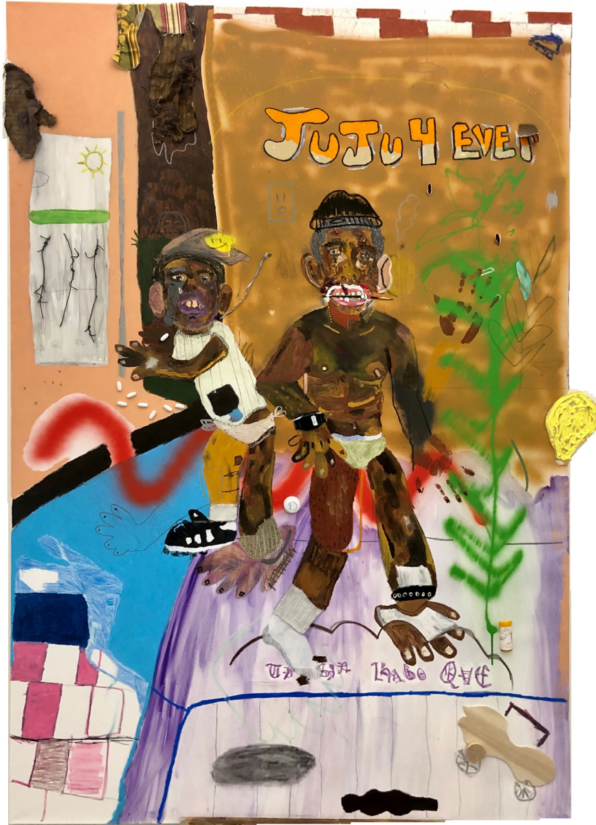
Que Hago Sin Ti Mixed media on canvas 72 x 49 in