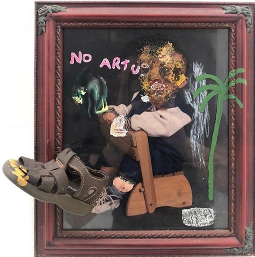
No Arturo Mixed media with frame 18 x 16 in