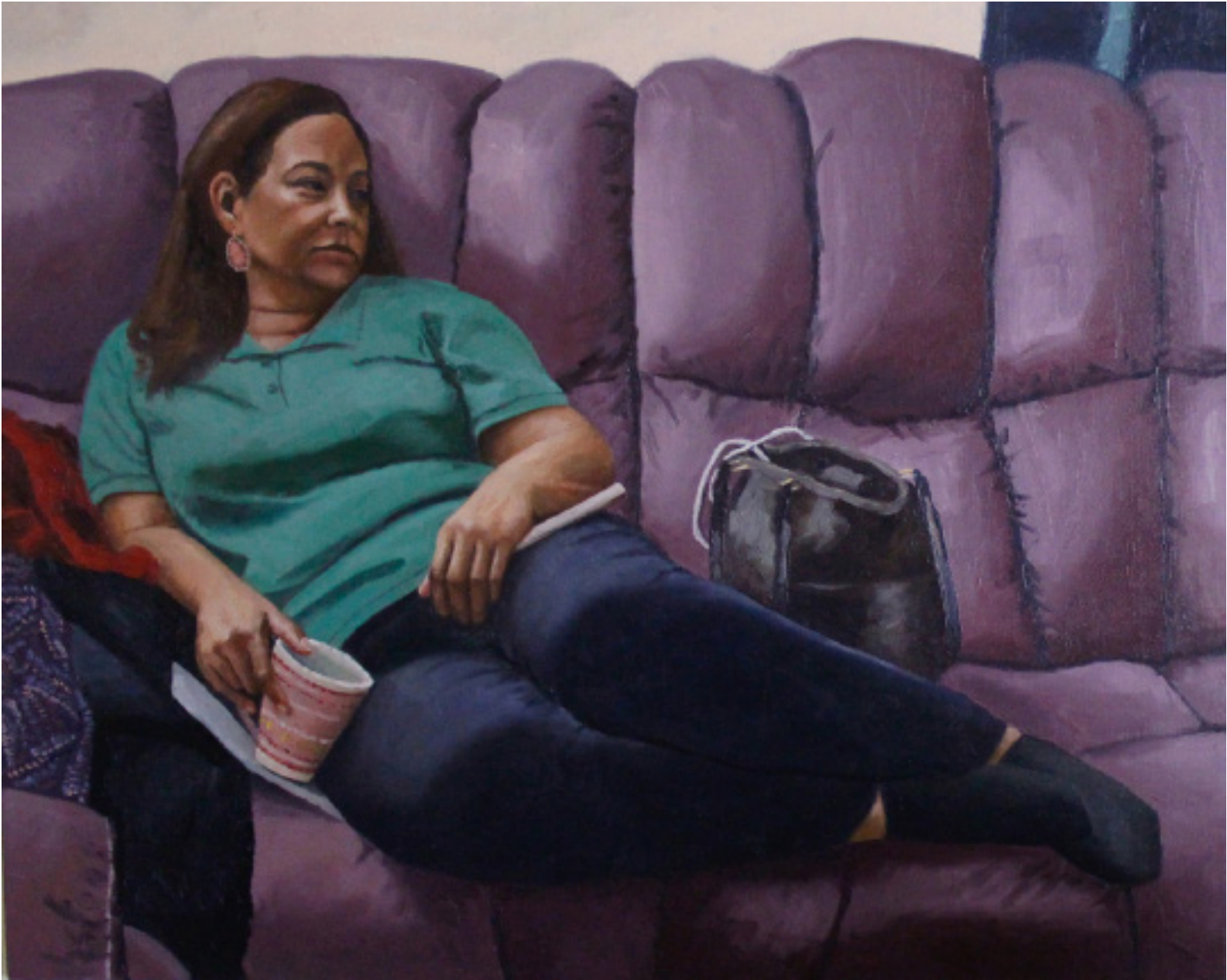
Mami Oil on canvas 30 x 24 in