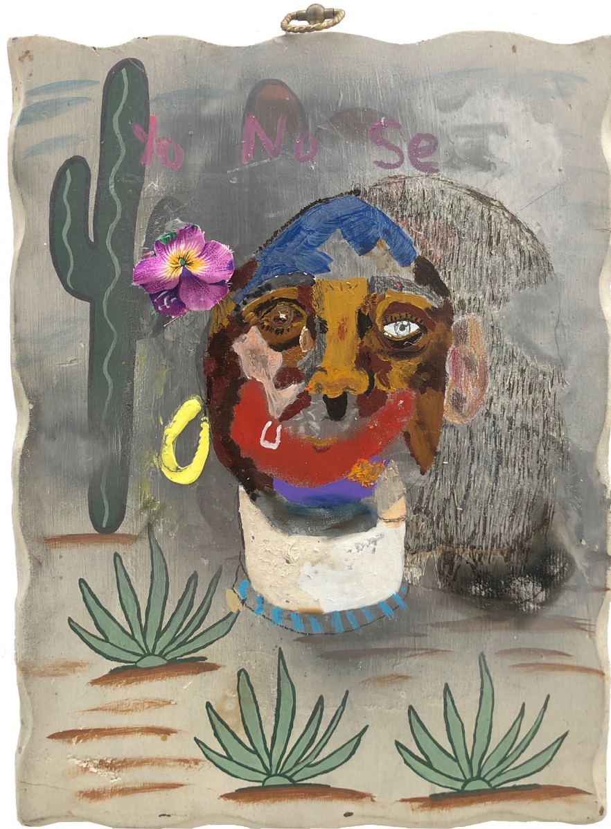
Yo No Se Mixed media on wood 24 x 16 in