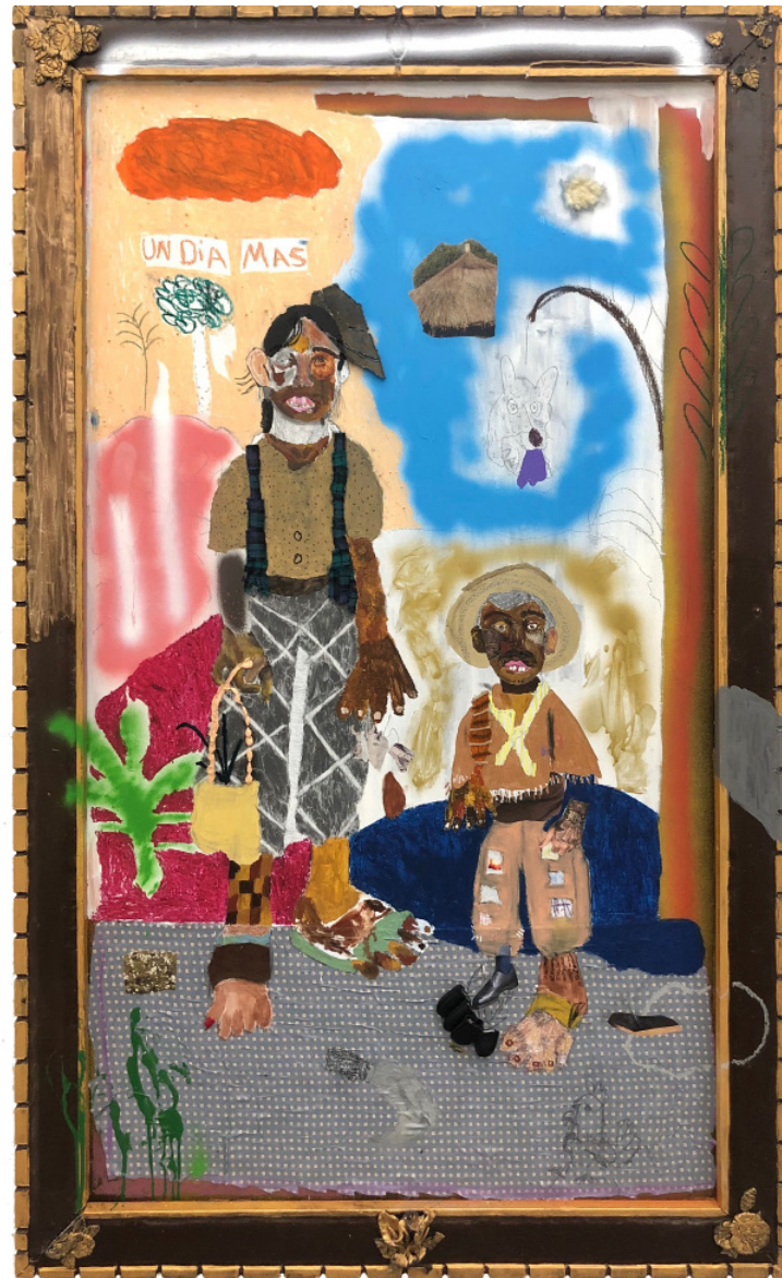
Un Dia Mas Mixed media on canvas 68 x 42 in