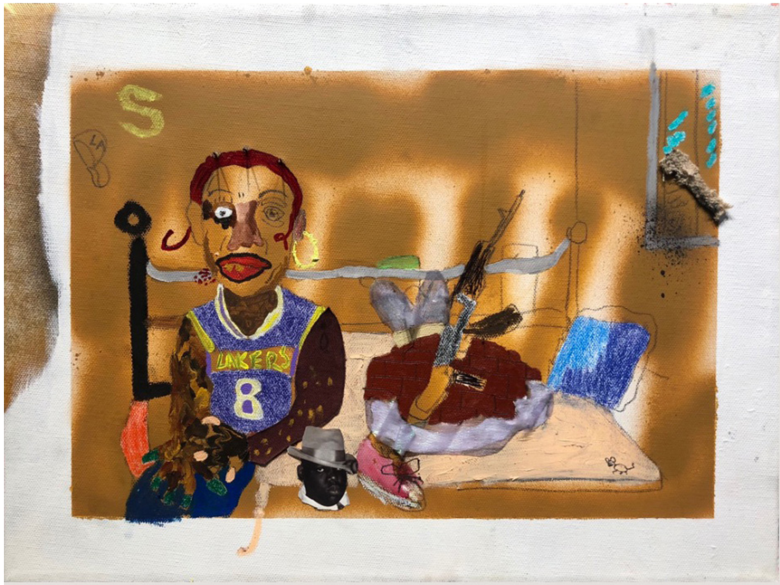
Mis 15 Mixed media on unstretched canvas 16 x 20 in