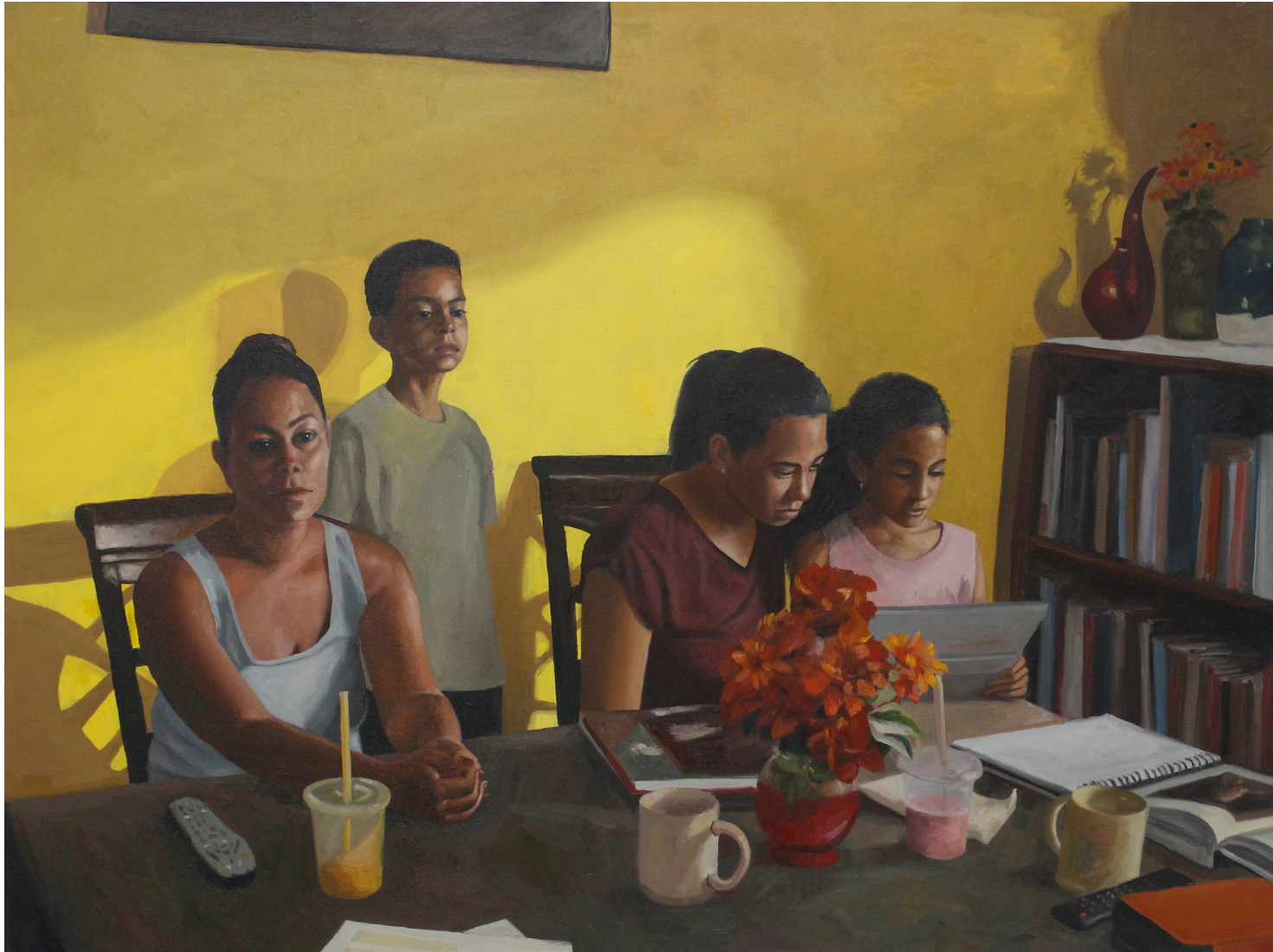
Misunderstanding Home Oil on canvas 36 x 48 in