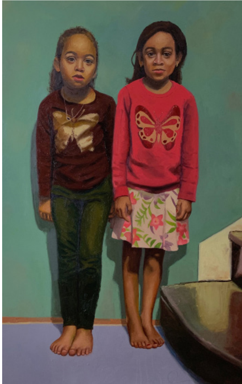
Transcending Joy Oil on canvas 40 x 26 in