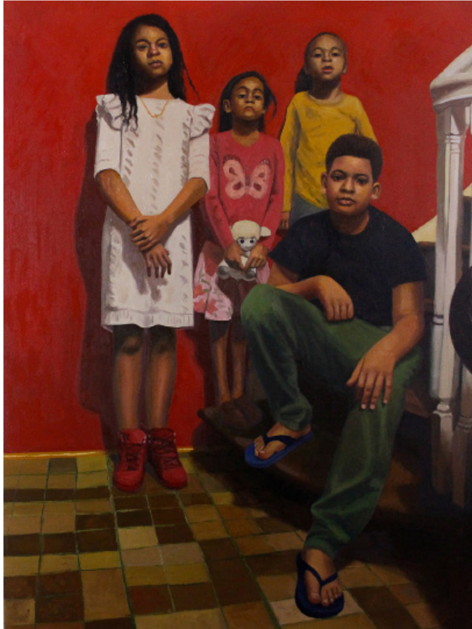
Los Primos de Philly Oil on canvas 40 x 30 in