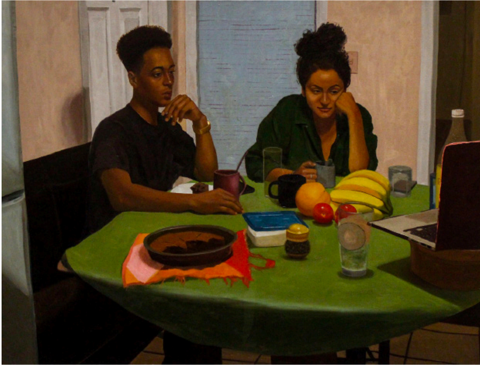
Those Moments Oil on canvas 36 x 48 in