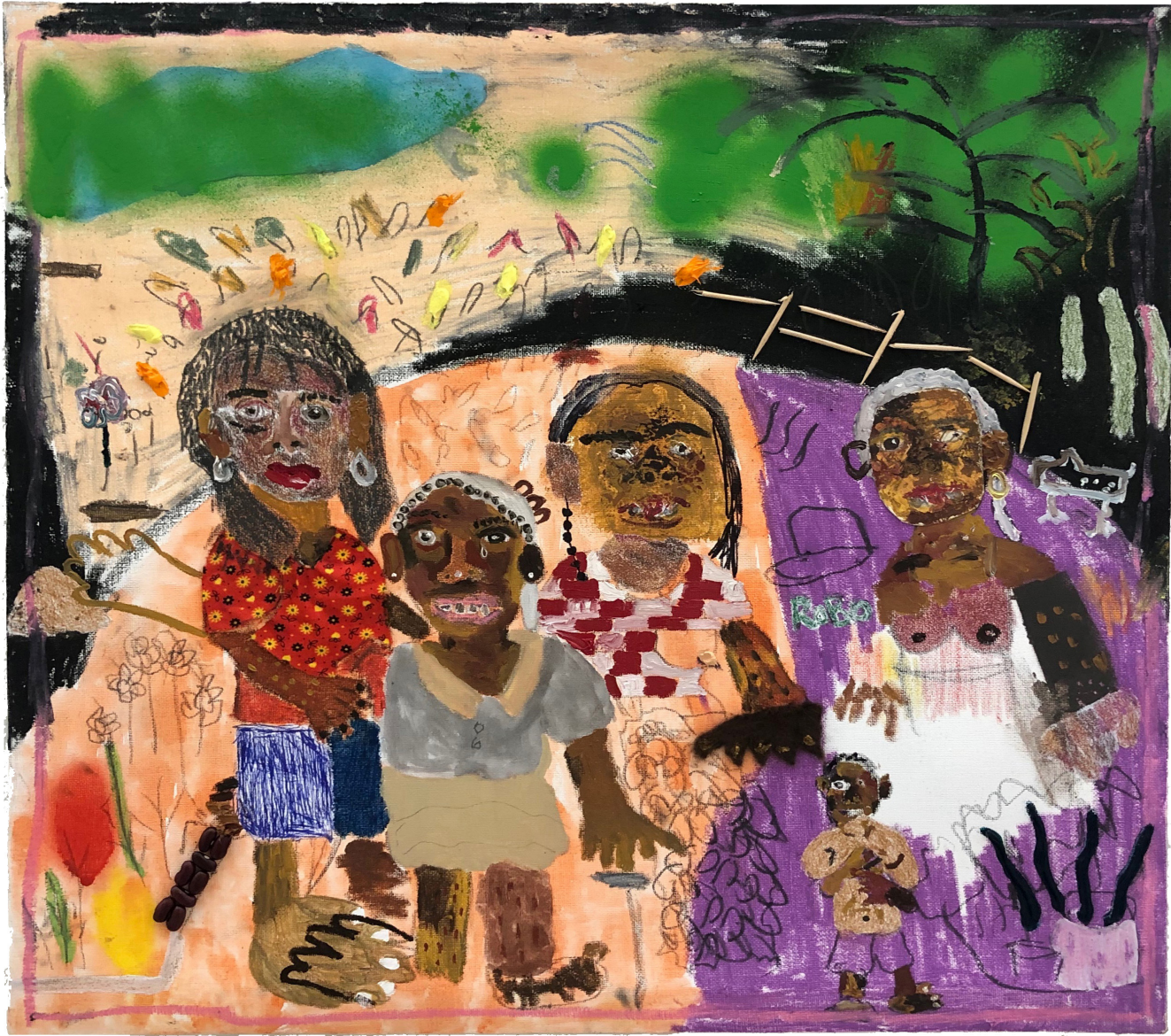
Mujeres de Campo Mixed media on canvas 17 1/2 x 18 in