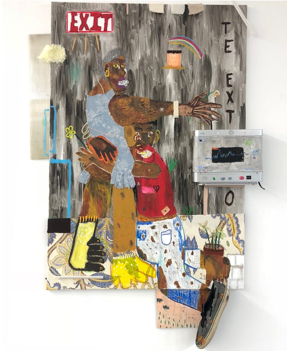
Te Extraño Mixed media on canvas 60 x 36 in