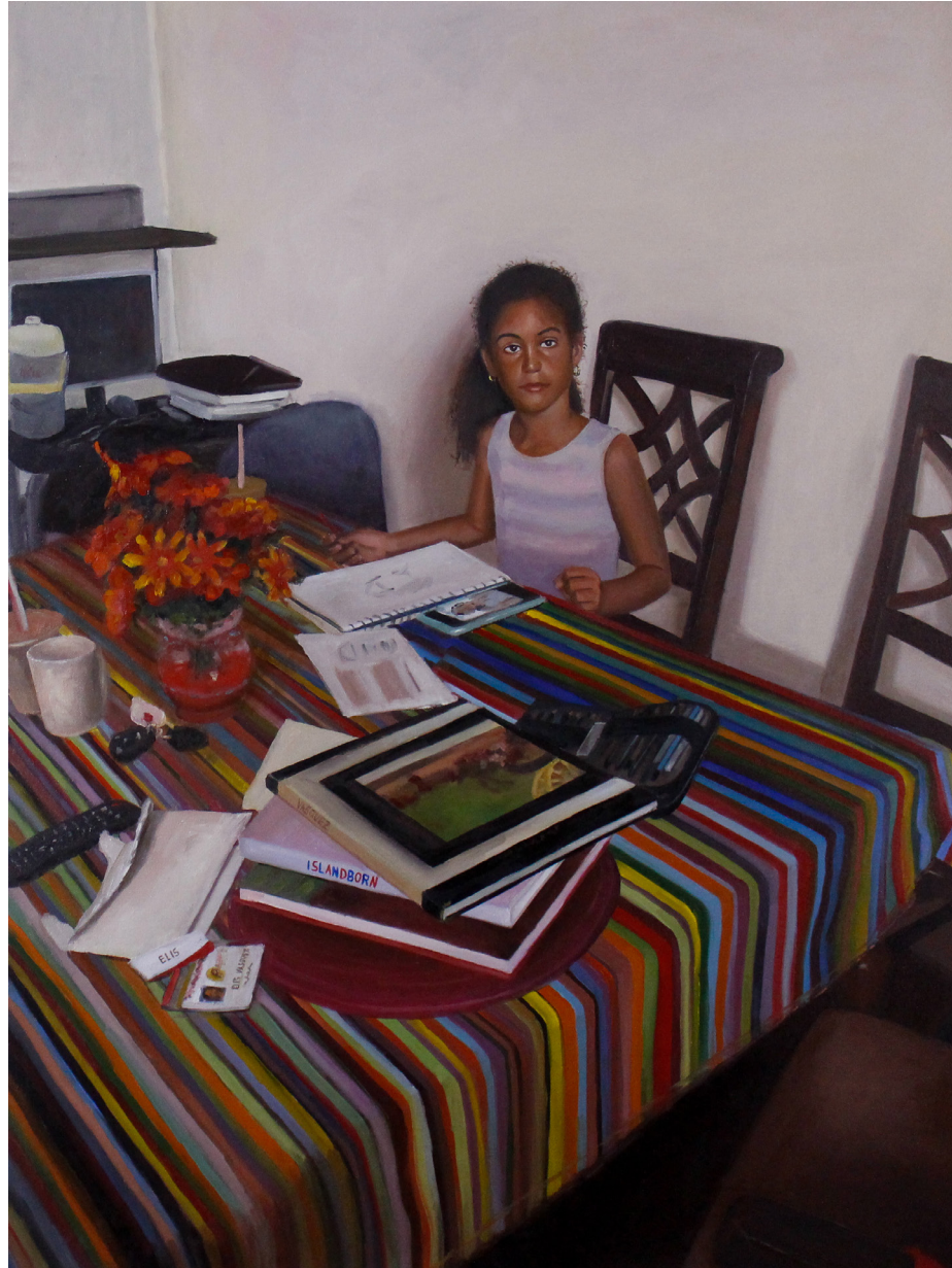
Portrait of a Potential Artist Oil on canvas 40 x 30 in