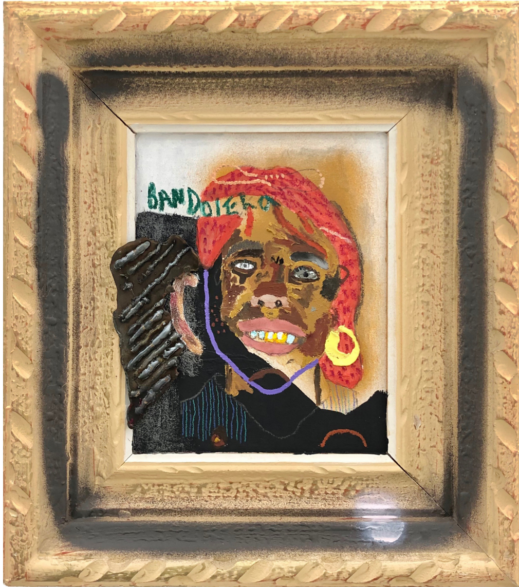
Bandolera Mixed media on panel 17 x 15 1/2 in