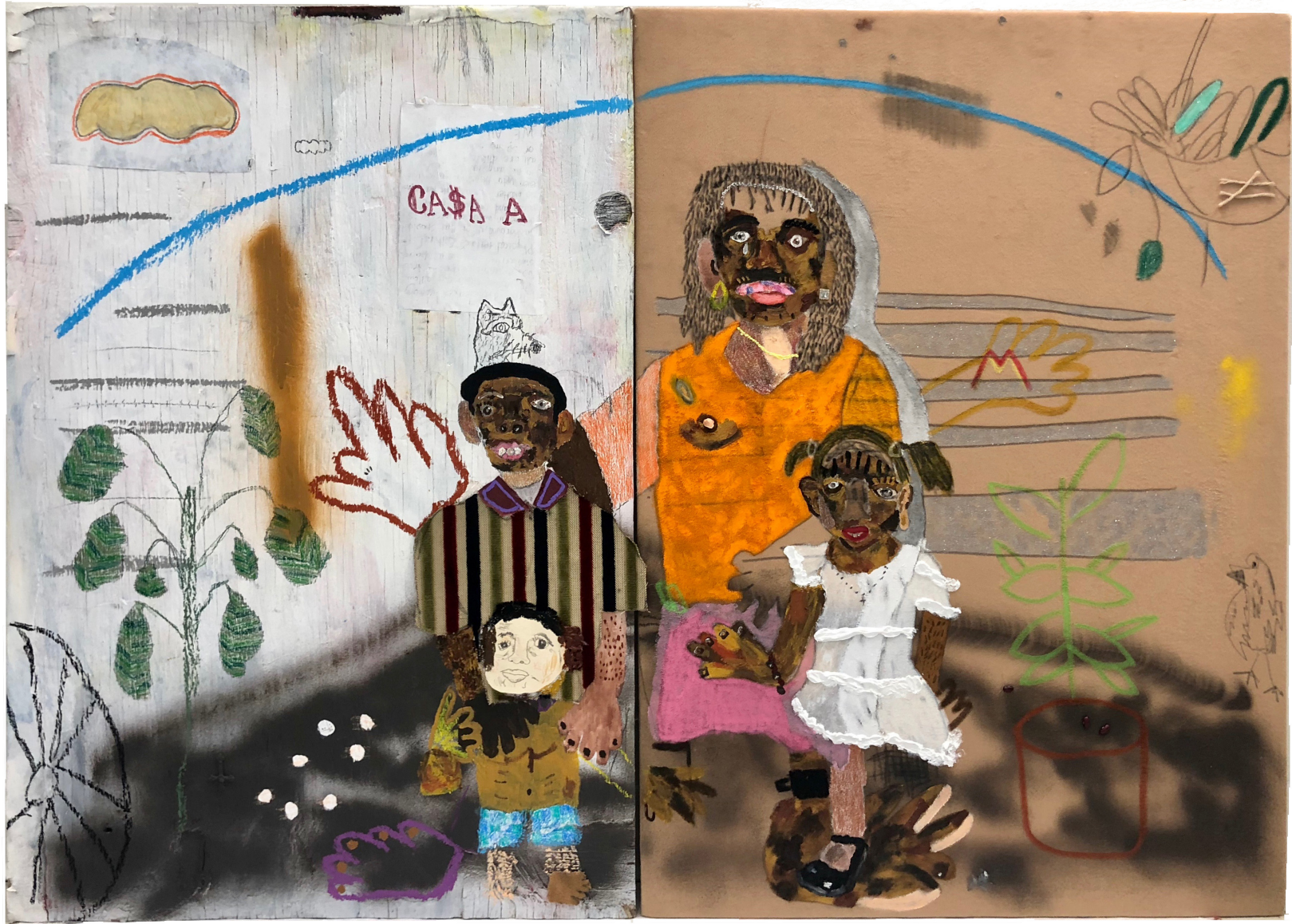
Llegando a la frontera Mixed media on canvas 36 x 52 in