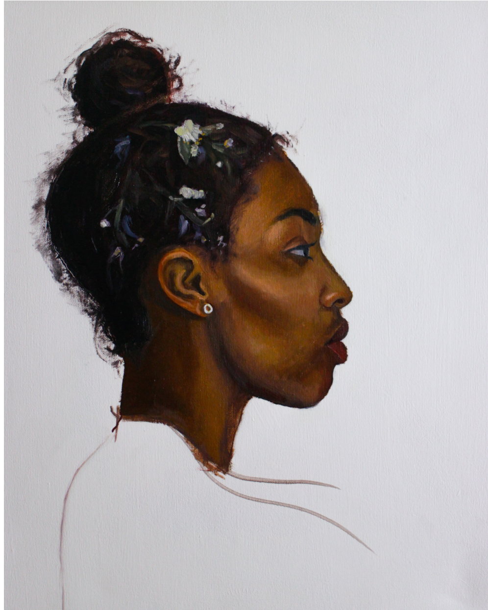
Shawnee Oil on canvas 16 x 20 in