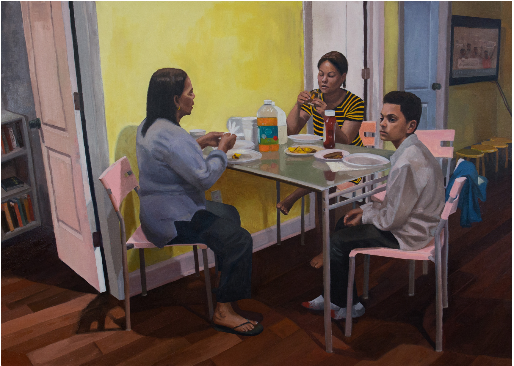
The Beautiful Ones Oil on canvas 40 x 56 in