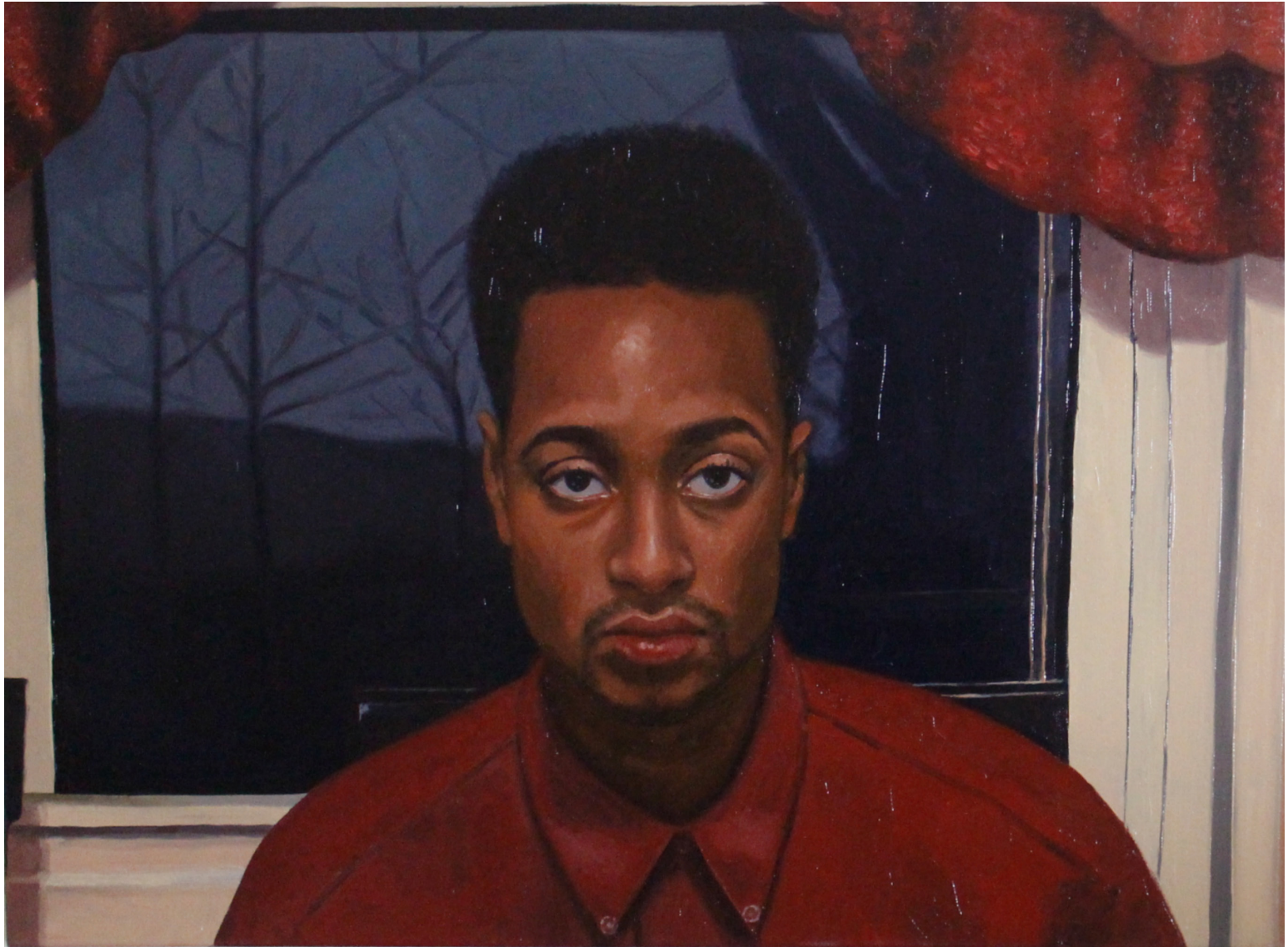
Seth Oil on canvas 18 x 24 in